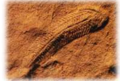
University of Adelaide