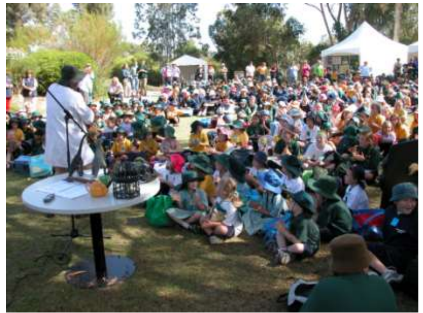
Community & Special events, conferences, visiting scientists