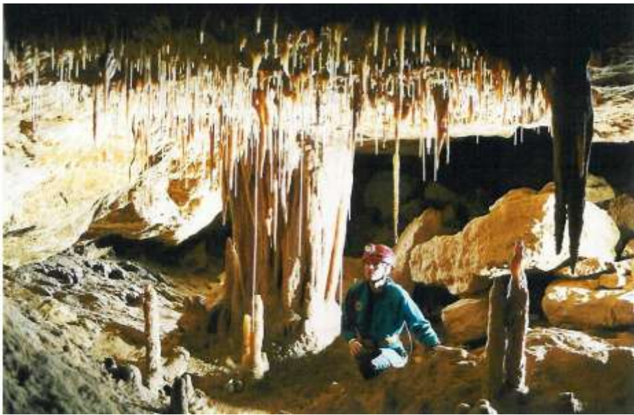
Adventure caving – strong cave conservation message.