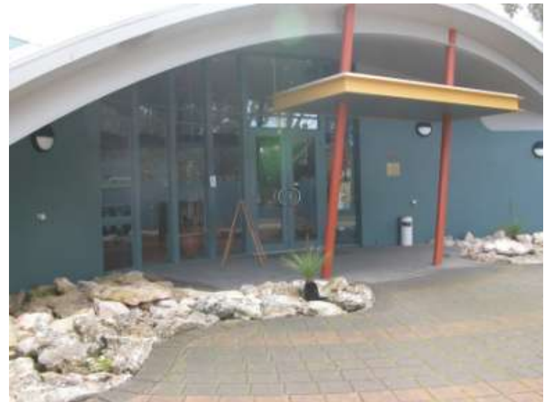
Guided and self-guided tours