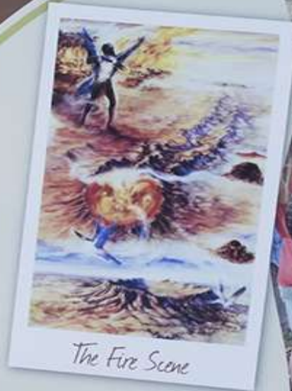
The Fire Scene

We trust your time here on our Yarta will be enriched with the spirit of the land and our people.